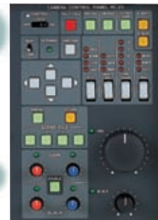
RC-Z3 Remote Control Unit

Various adjustments can be made remotely, either from an optional compact remote control unit, or from a personal computer.