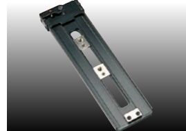
TA-Z3 Tripod adaptor