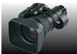
A20 x 8.6BRM-24 Zoom lens