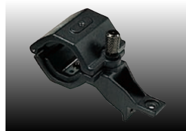
MH-Z3 Microphone holder