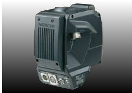
CA-Z35 Camera adaptor for RU-Z25