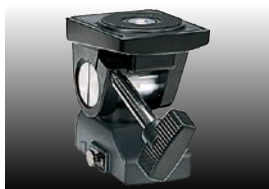
AT-30 View finder adaptor for GM-51