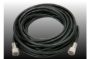
C-502KAB/C-152KAB/C-103KAB Camera cable