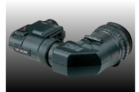
GM-9 1.5-inch view finder