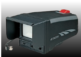
GM-51 5-inch view finder