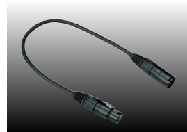
C-300MA Microphone cable