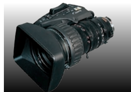
YJ19 x 9BKRS Zoom lens