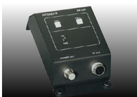
EA-Z35 Extension adaptor for CA-Z35